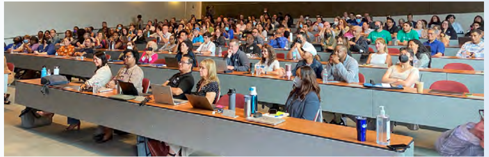
Contra Costa College employees listen to ACD presentations.

The fall semester kicked off with All-College Day (ACD) celebrations on Friday, August 18 th .